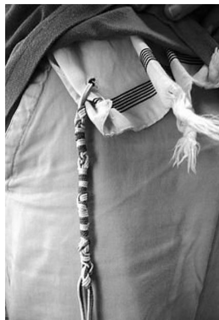
Image: "Tzitzit with Tchelet [thread of blue]" החבילן, CC0, via Wikimedia Commons.

-- Feb 19, 2021 CC BY-SA 4.0 copyleft Rabbi S.M. Friedman