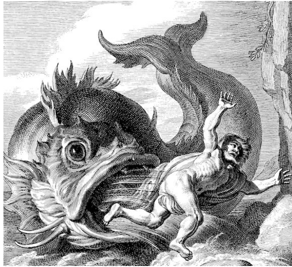
Alt text: Detailed drawing of an incredibly large fish, with a powerful tail and mouth, spewing a bearded, befuddled-looking man out of its mouth and toward land.