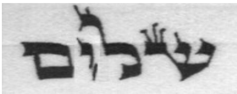
Image of the word Shalom in Hebrew -- shin - lamed - vav - mem -- with broken vav

As Pinchas appears in most places in Torah, e.g., Num 25:7 [normal size י]